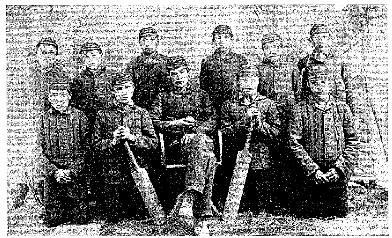
The Battleford, Saskatchewan, school cricket team in 1895. In 1899, an Indian Affairs official wrote of the Battleford school, "A noticeable feature of this school is its games. They are all thoroughly and distinctly 'white'. The boys use the boxing gloves with no little science, and excellent temper and play good games of cricket and football with great interest and truly Anglo-Saxon vigor."

the system's overall failings, but they are also part of the residential school story.