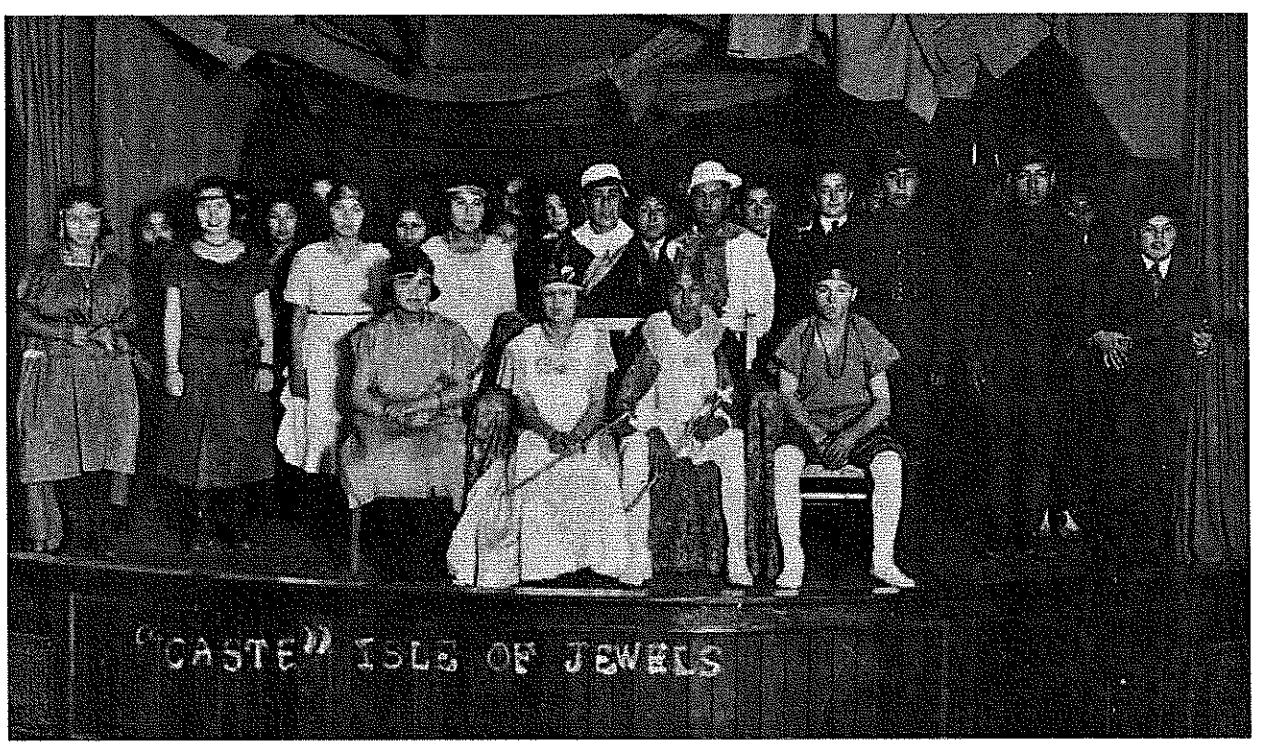
The student cast of the play Isle of Jewels at the Coqualeetza, British Columbia, school. The United Church of Canada Archives, 93.049P424N. (19--?)

Many other Aboriginal leaders attended residential schools, and while they may have developed leadership skills in the schools, they often also became the system's harshest critics.